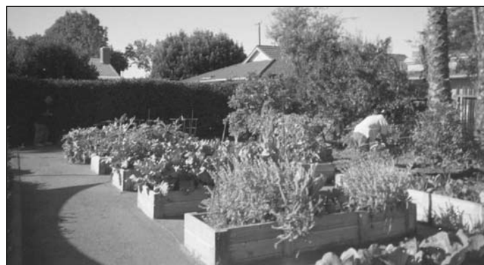
Overflowing vegetable garden